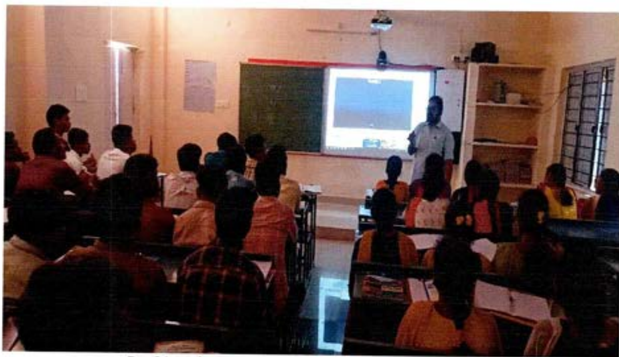
Day 2 Introduction to syllabus and do's and don'ts in campus