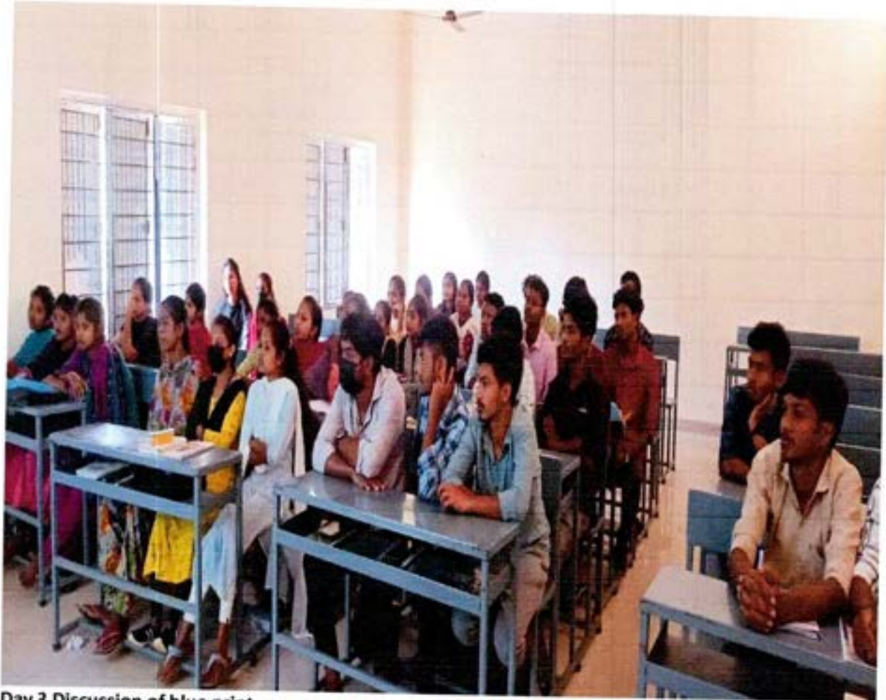
Day 3 Discussion of blue print

Est: 1985 NAAC "C" Grade phone no: 08935 250013 Email.ID : Paderu.jkc@gmail.com.