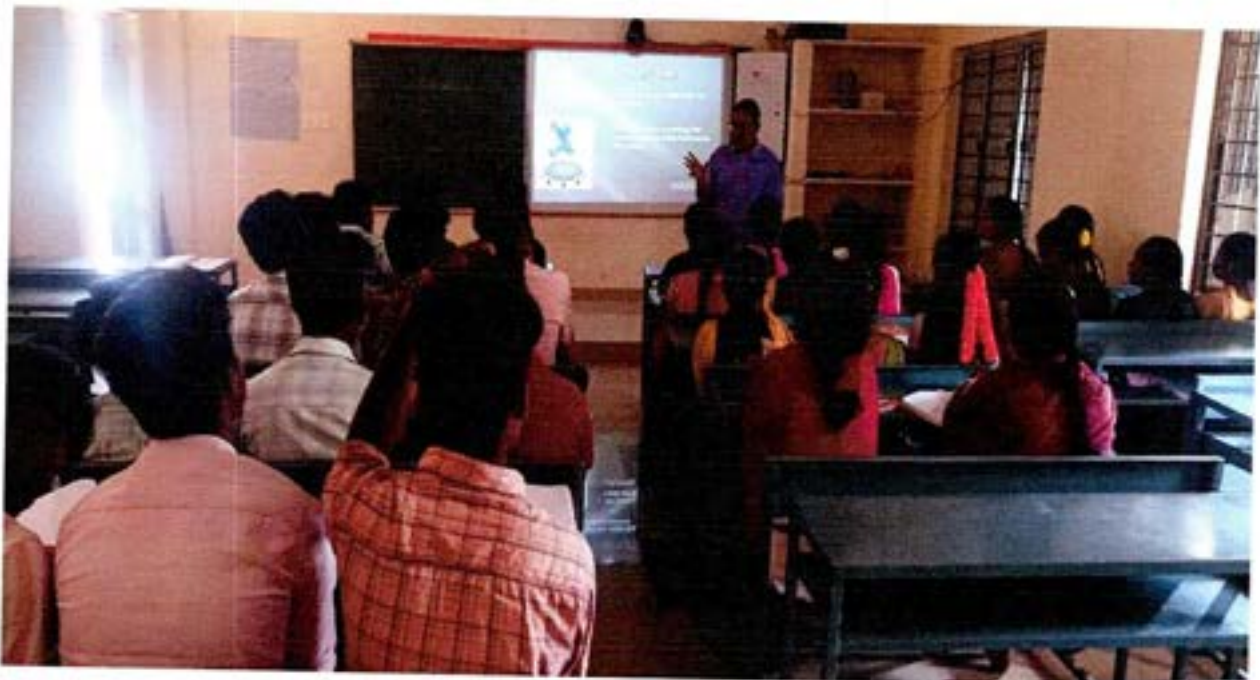
Day 4 Introduction to basic topics