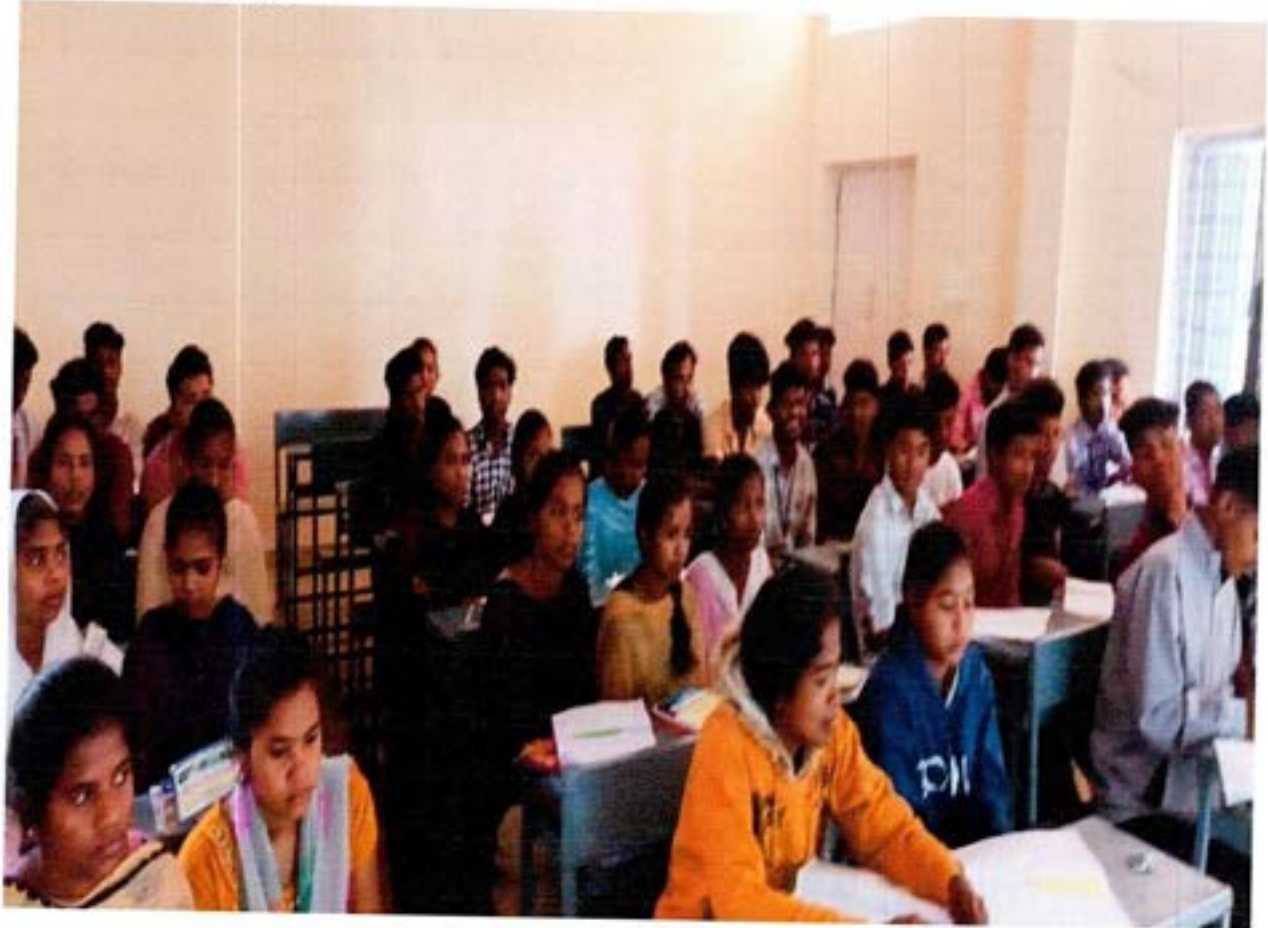
Day 6 Last day of induction programme