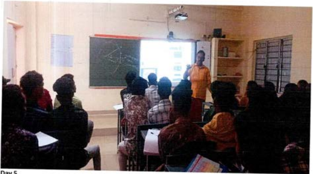
Day 5 Introduction to basics

Est: 1985 NAAC "C" Grade phone no: 08935 250013 Email.ID :Paderu.jkc@gmail.com.