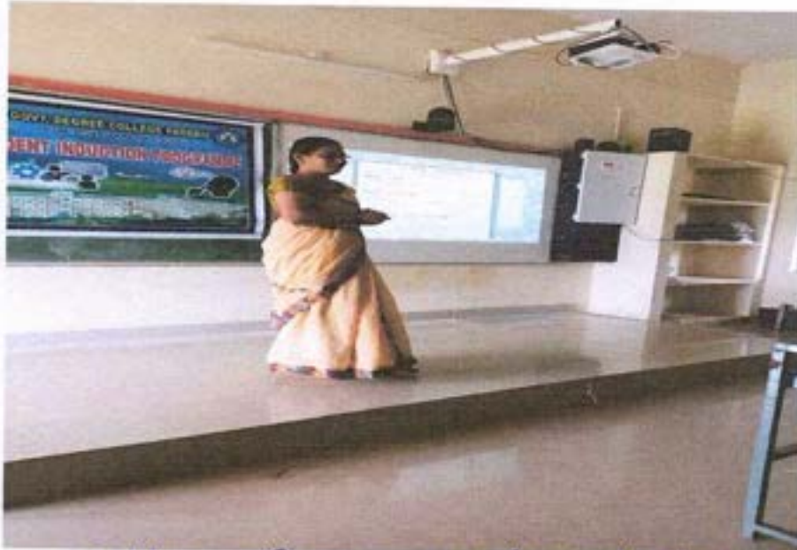
Explaining course outlines to the students.

(Upgraded to Model Degree College under RUSA 2.0) Paderu, Alluri Sitharama Raju - District, AP. Est: 1985 NAAC "C" Grade phone no: 08935 250013 Email ID: paderu.jkc@gmail.com.