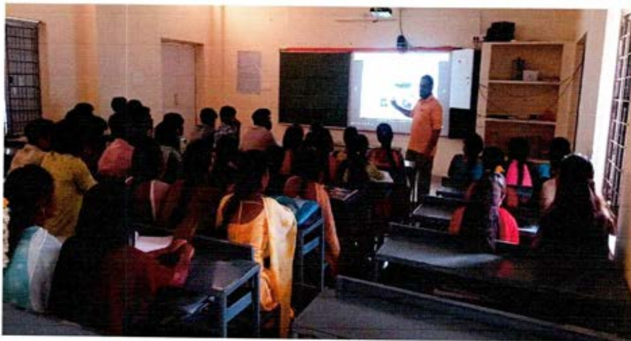
Day 1 interaction with students

Est: 1985 NAAC "C" Grade phone no: 08935 250013 Email.ID : Paderu.jkc@gmail.com.